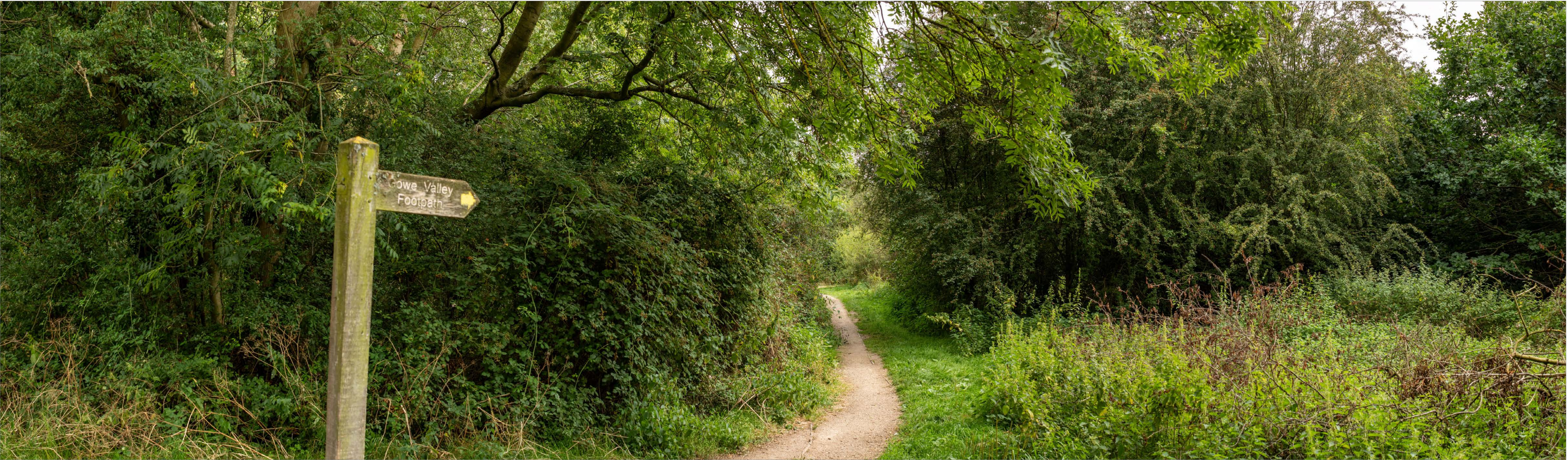
A46 Coventry Junctions (Walsgrave) - Photomontages Figure 7.4.5B - Viewpoint 05: Recreational users of Sowe Valley and residential receptors off northern end of Dorchester Way, Walsgrave - Abbotsbury Close/ Bridport Close. Existing View (Summer)