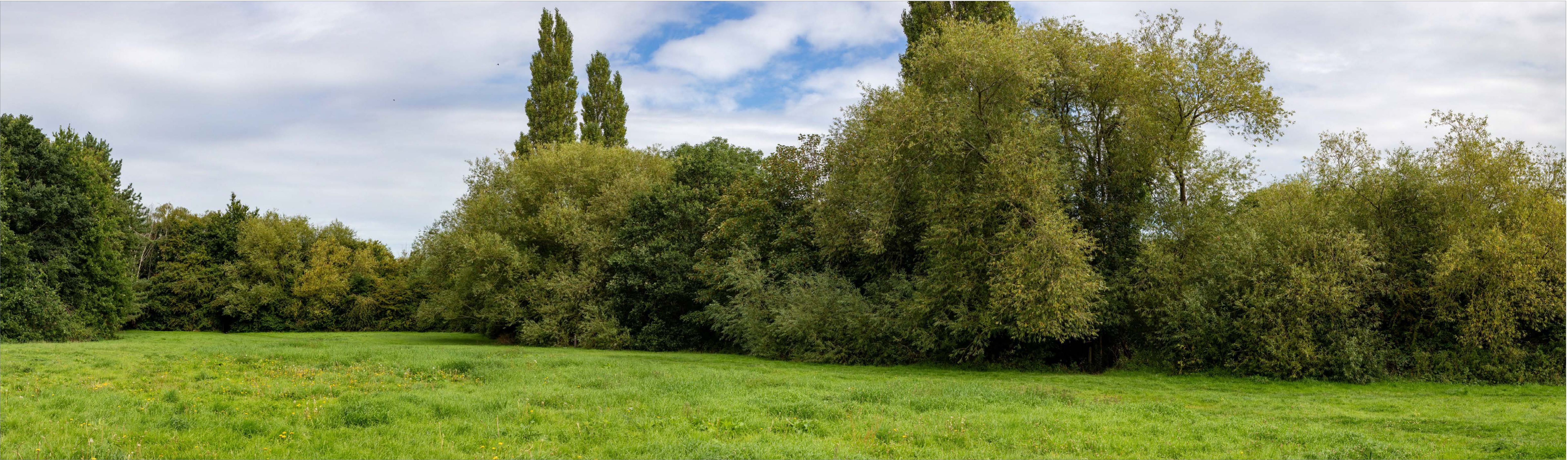
A46 Coventry Junctions (Walsgrave) - Photomontages Figure 7.4.8B - Viewpoint 08: Recreational users of Gainford Rise Open Space by Smite Brook and residential receptors off northern end of Royston Close, Faygate Close and Gainford Rise. Existing View (Summer)