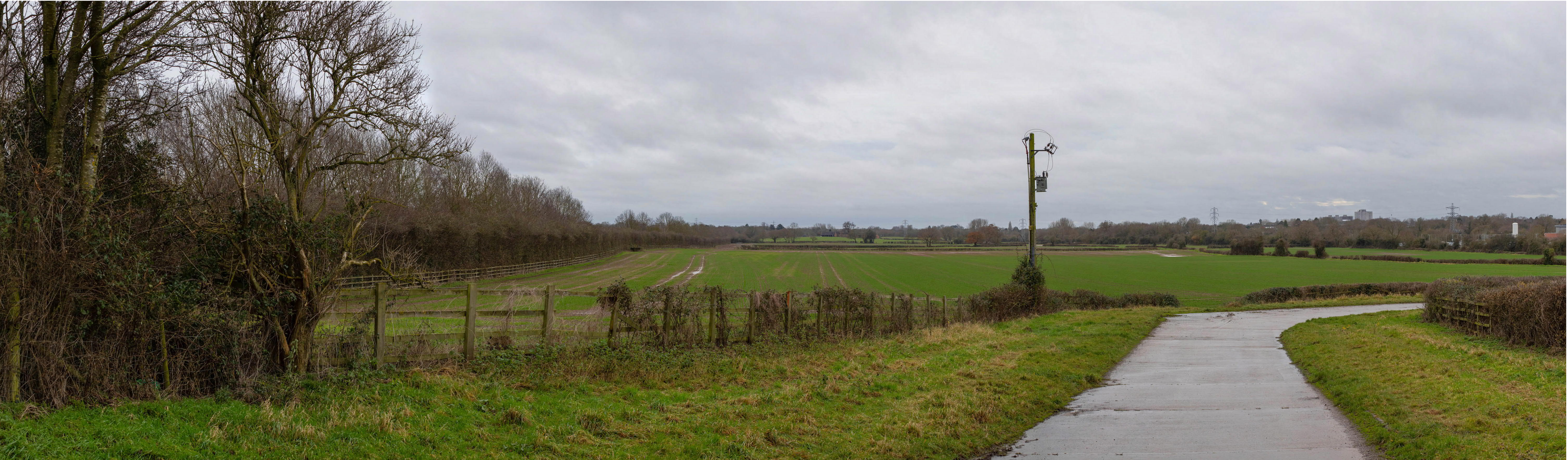
A46 Coventry Junctions (Walsgrave) - Photomontages Figure 7.4.1A - Viewpoint 01: Recreational users of public path to Coombe Country Park/ PRoW R75x and residential receptors at Farber Road/ Barrow Close, Walsgrave. Existing View (Winter)