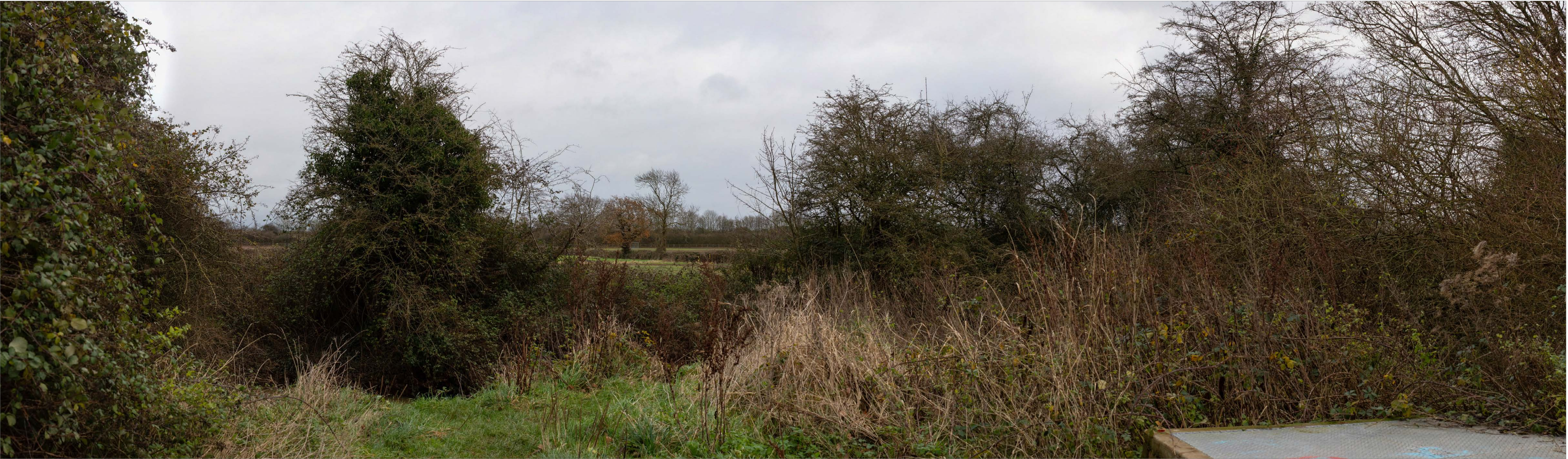
A46 Coventry Junctions (Walsgrave) - Photomontages Figure 7.4.4A - Viewpoint 04: Recreational users of Sowe Valley and Dorchester Way Open Space. Existing View (Winter)