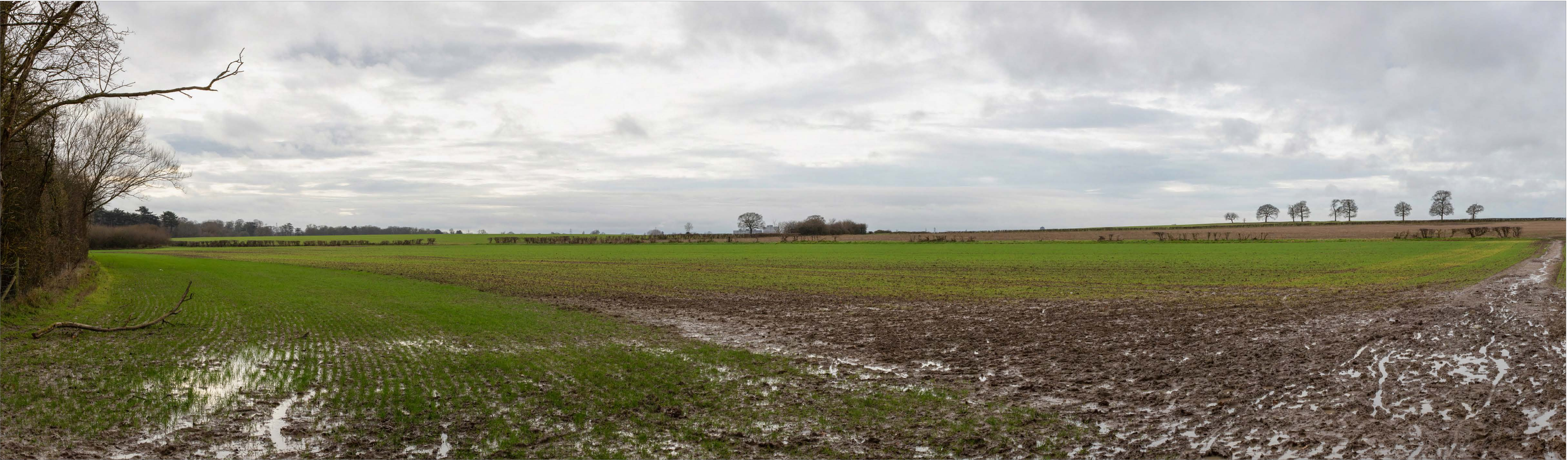
A46 Coventry Junctions (Walsgrave) - Photomontages Figure 7.4.3A - Viewpoint 03: Recreational receptors along the section of Centenary Way close to Coombe Country Park. Existing View (Winter)