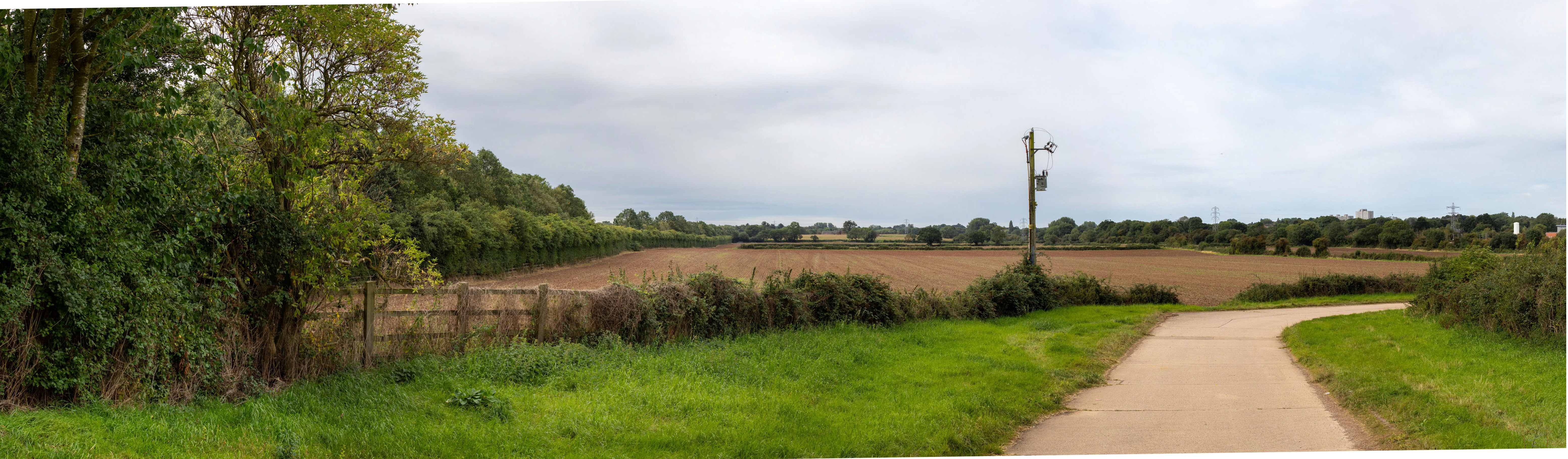
A46 Coventry Junctions (Walsgrave) - Photomontages Figure 7.4.1B - Viewpoint 01: Recreational users of public path to Coombe Country Park/ PRoW R75x and residential receptors at Farber Road/ Barrow Close, Walsgrave. Existing View (Summer)