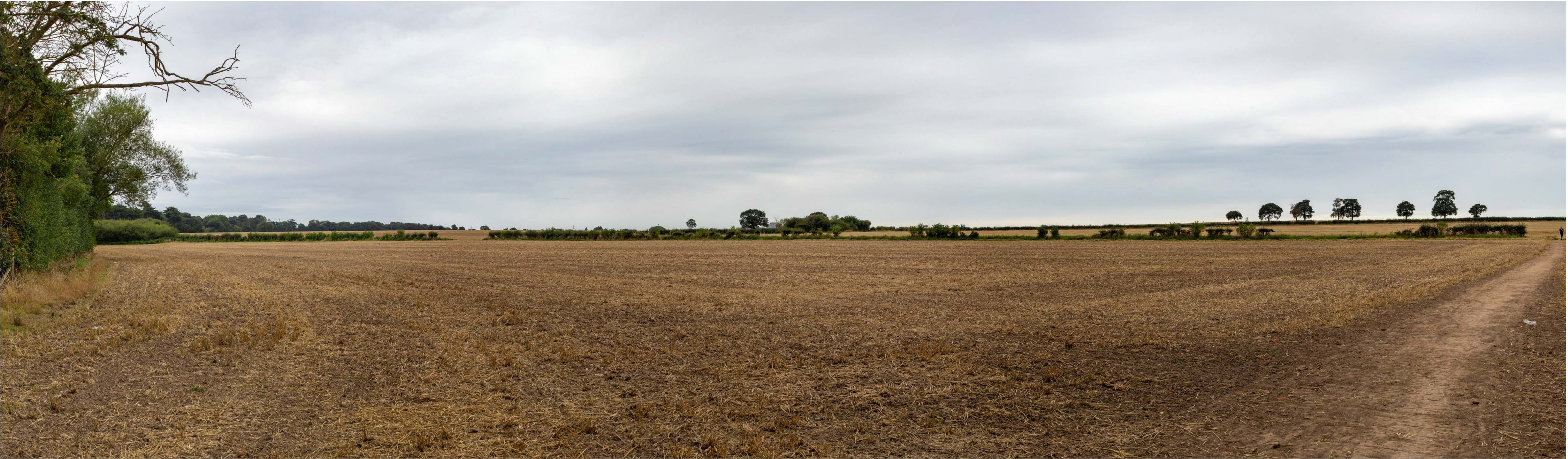
A46 Coventry Junctions (Walsgrave) - Photomontages Figure 7.4.3B - Viewpoint 03: Recreational receptors along the section of Centenary Way close to Coombe Country Park. Existing View (Summer)