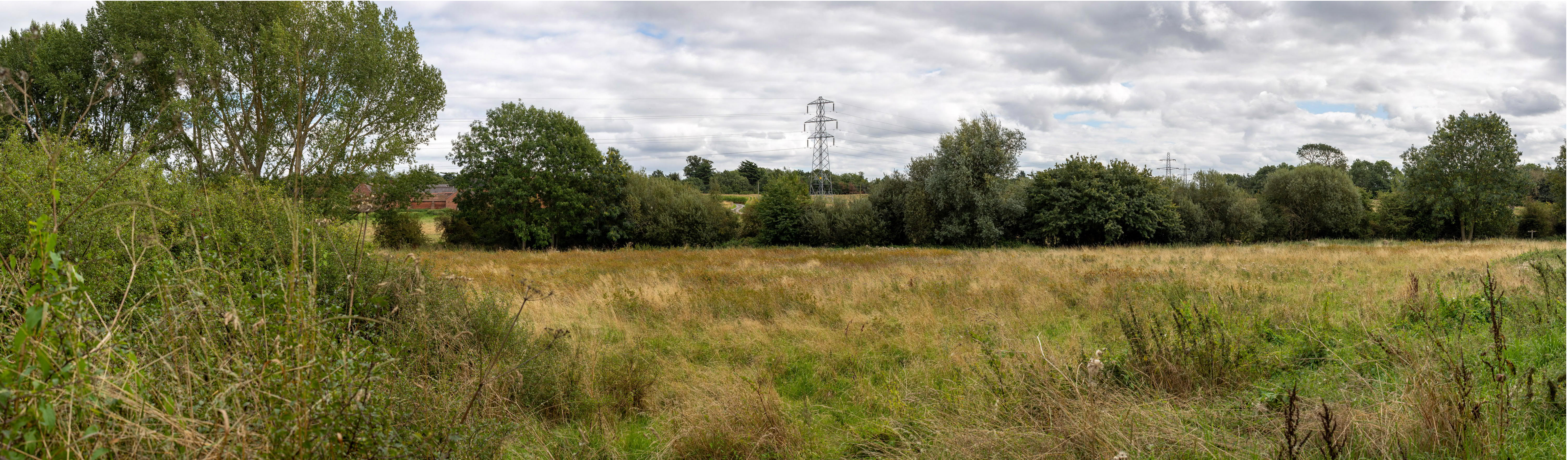
A46 Coventry Junctions (Walsgrave) - Photomontages Figure 7.4.6B - Viewpoint 06: Recreational users of Sowe Valley and residential receptors off southern end of Dorchester Way, Walsgrave - Sturminster Close and Fontmell Close. Existing View (Summer)