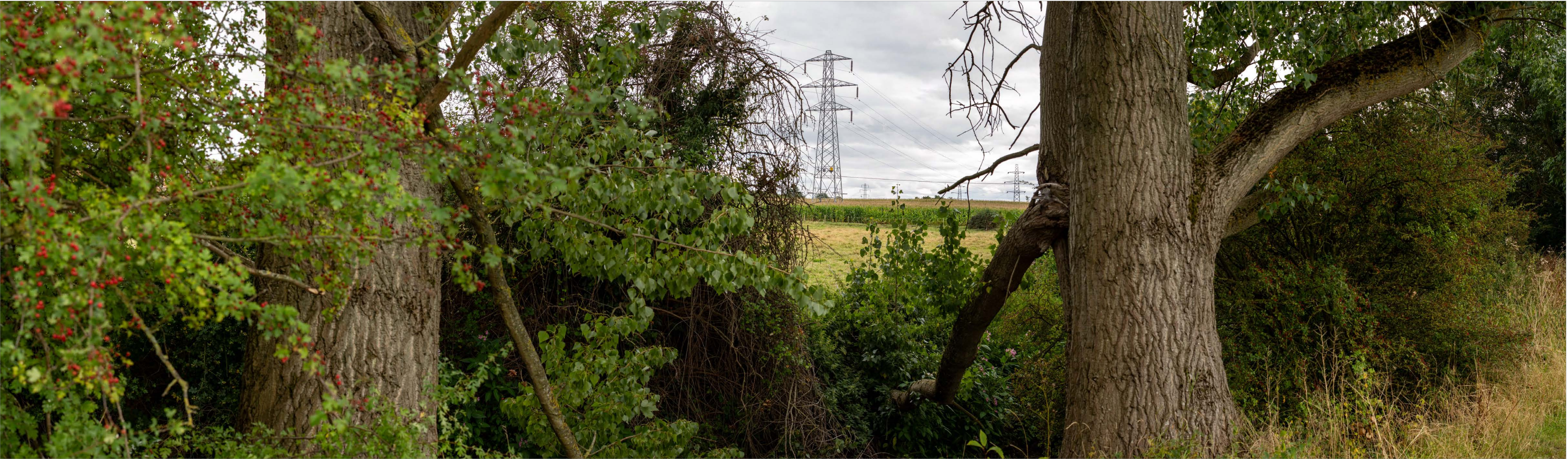
A46 Coventry Junctions (Walsgrave) - Photomontages Figure 7.4.7B - Viewpoint 07: Recreational users of Sowe Valley Path.