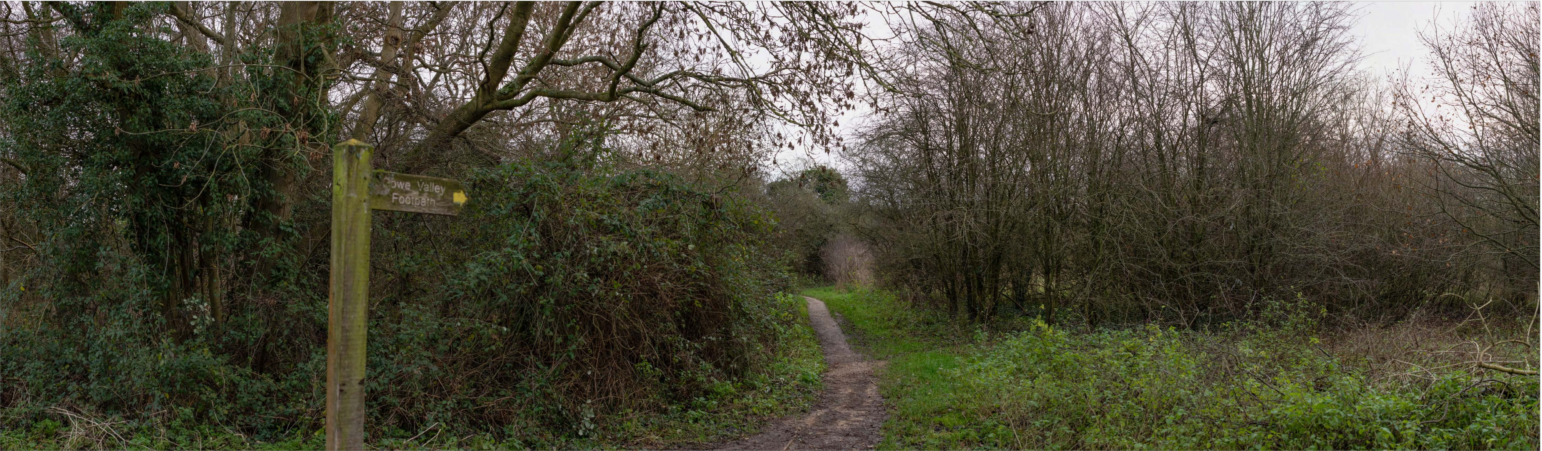
A46 Coventry Junctions (Walsgrave) - Photomontages Figure 7.4.5A - Viewpoint 05: Recreational users of Sowe Valley and residential receptors off northern end of Dorchester Way, Walsgrave - Abbotsbury Close/ Bridport Close. Existing View (Winter)