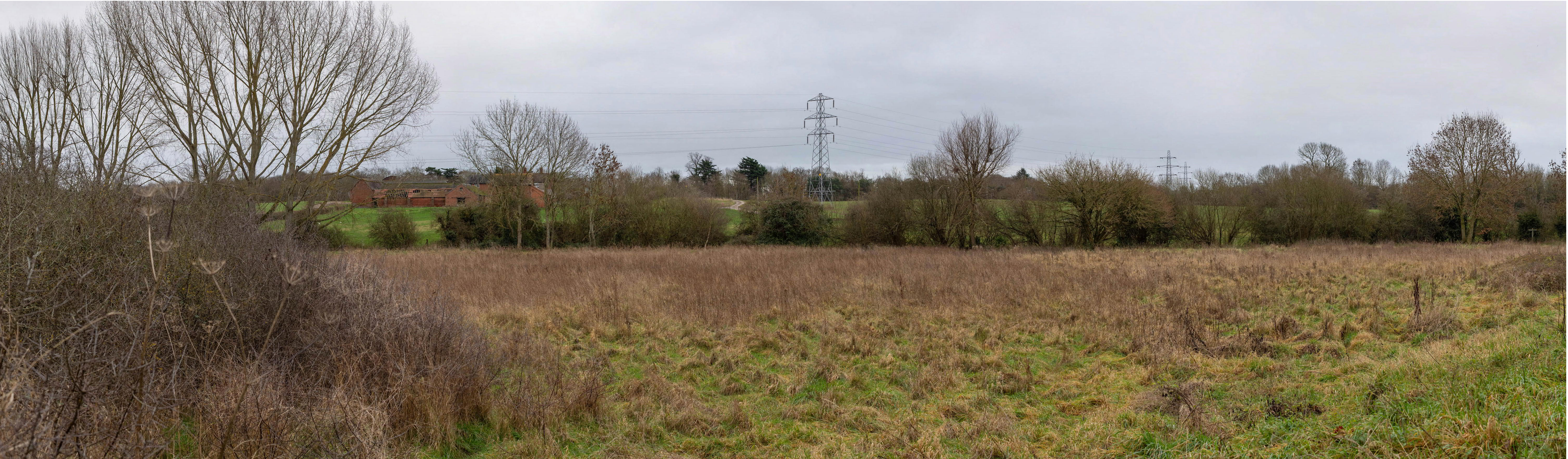
A46 Coventry Junctions (Walsgrave) - Photomontages Figure 7.4.6A - Viewpoint 06: Recreational users of Sowe Valley and residential receptors off southern end of Dorchester Way, Walsgrave - Sturminster Close and Fontmell Close. Existing View (Winter)