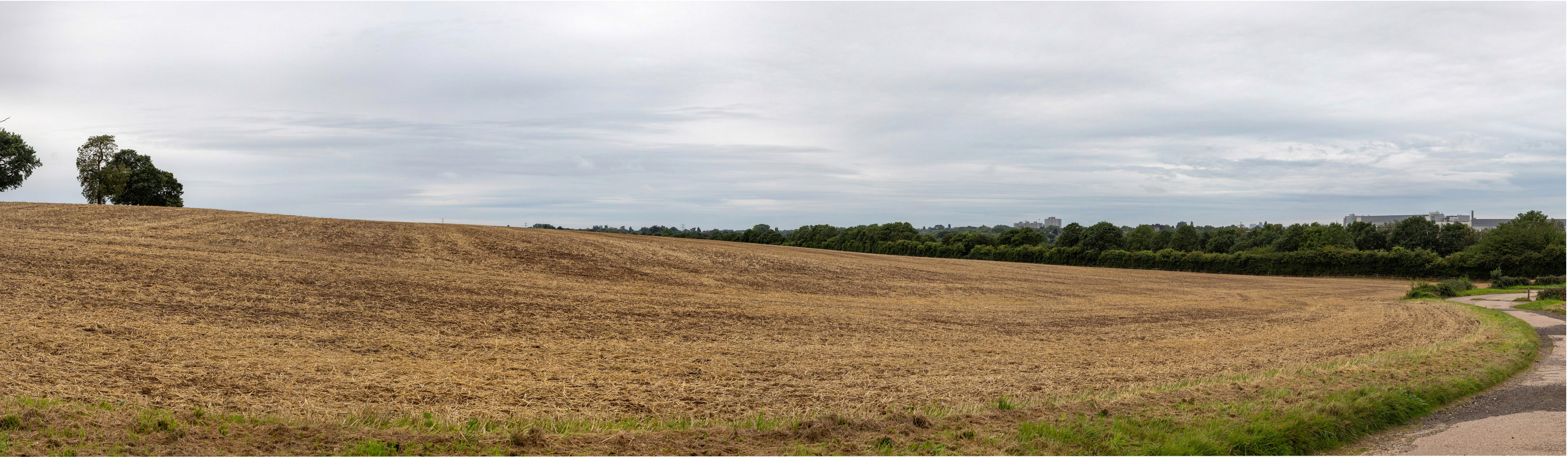
A46 Coventry Junctions (Walsgrave) - Photomontages Figure 7.4.2B - Viewpoint 02: Recreational receptors along the PRoW R75x at Walsgrave Hill. Existing View (Summer)