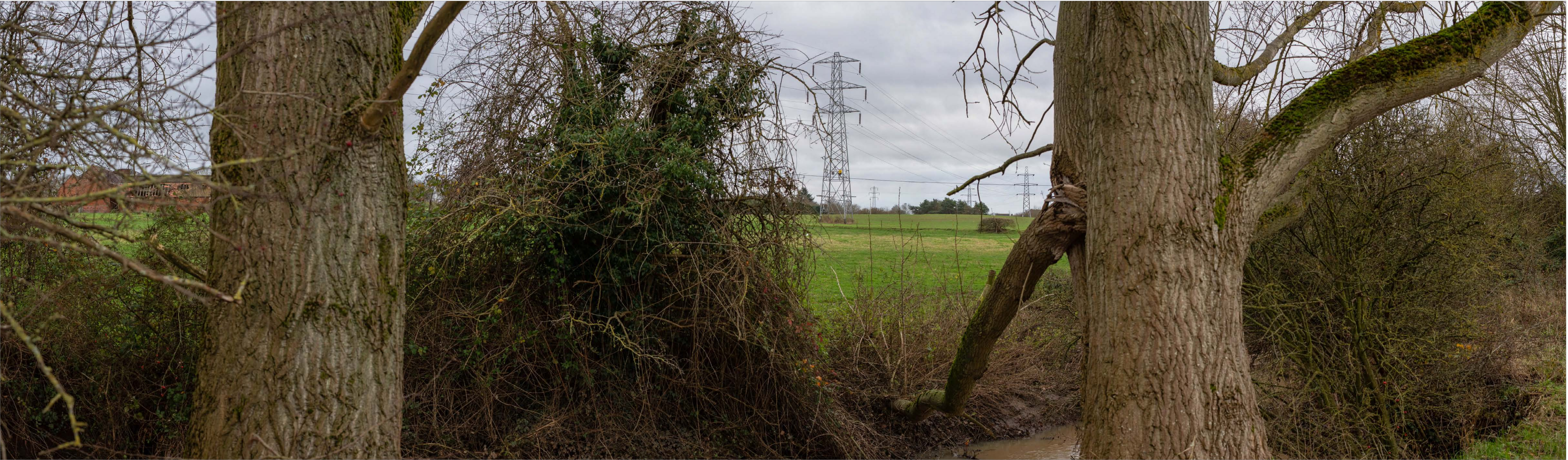
A46 Coventry Junctions (Walsgrave) - Photomontages Figure 7.4.7A - Viewpoint 07: Recreational users of Sowe Valley Path.