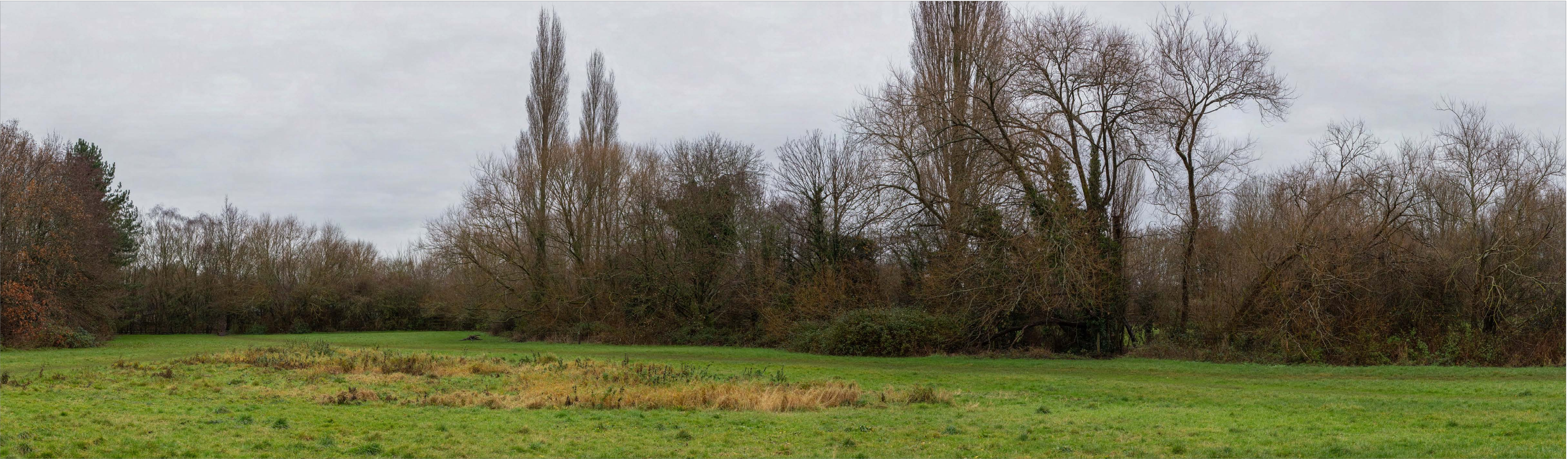
A46 Coventry Junctions (Walsgrave) - Photomontages Figure 7.4.8A - Viewpoint 08: Recreational users of Gainford Rise Open Space by Smite Brook and residential receptors off northern end of Royston Close, Faygate Close and Gainford Rise. Existing View (Winter)