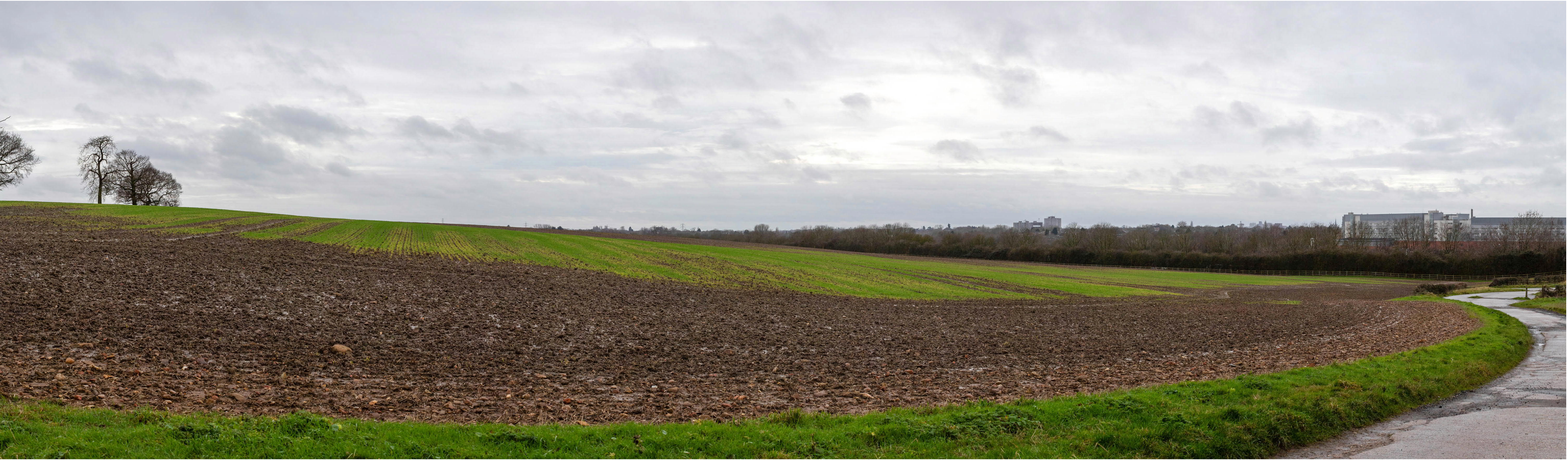
A46 Coventry Junctions (Walsgrave) - Photomontages Figure 7.4.2A - Viewpoint 02: Recreational receptors along the PRow R75x at Walsgrave Hill. Existing View (Winter)