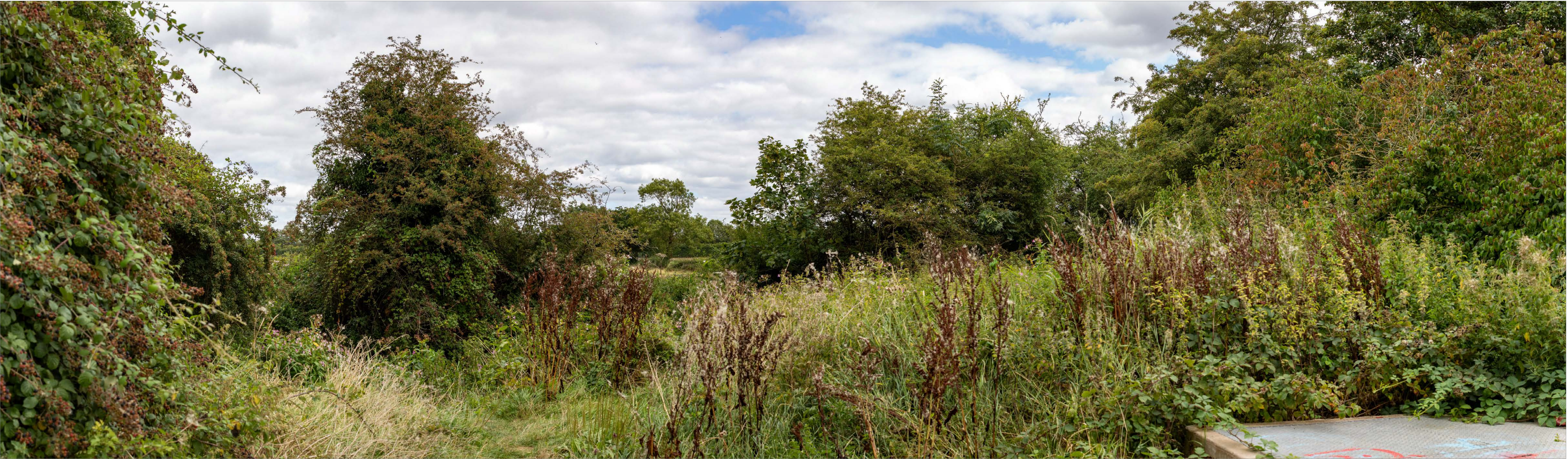
A46 Coventry Junctions (Walsgrave) - Photomontages Figure 7.4.4B - Viewpoint 04: Recreational users of Sowe Valley and Dorchester Way Open Space. Existing View (Summer)